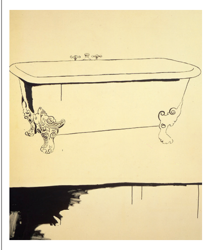
This famous Andy Warhol painting was spot cleaned by using a beam of atomic oxygen.

Atomic oxygen proved to work wonders, and the soot and char came off to reveal the image below it. Since the treatment is a gas, the underlying layers were not harmed. The treatment doesn't work on everything and won't replace other techniques altogether, but the conservator was impressed