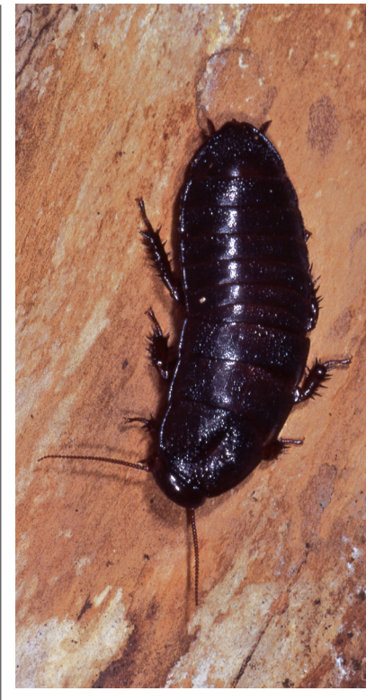
The wood roach Cryptocercus punctulatus on