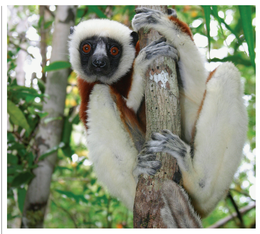
A lemur called coquerel sifaka.

The lemur known to scientists as Propithecus coquereli is about the