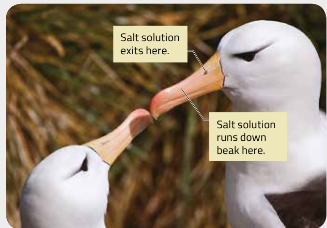
Figure 2 Marine birds and reptiles are apt to have salt gland to pump excess salt.